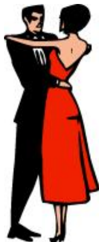
Dancing till late Raffle etc,

Saturday 18 th November 2017 Hampshire Suite Holiday Inn, Farnborough, 3 course meal £35